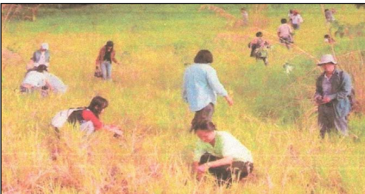
Tree Planting in Pangasinan. PWPA Pangasinan Chapter with the Department of Environment and Natural Resources, PNP-Regional Mobile Group and San Roque Power Corp. jointly undertook tree planting at the San Roque Dam Watershed area (San Nicholas side) last December 7, 2007.