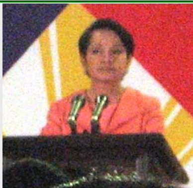
Well Done. President Gloria Macapagal-Arroyo speaks before the stakeholders/ participants of the 2008 Philippine Energy Summit.

President Gloria Macapagal-Arroyo keynoted the event and received the report of the Summit. She expressed her delight as she