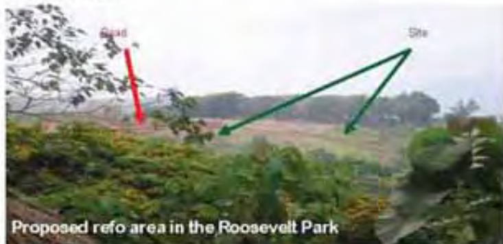
Proposed refo area in the Roosevelt Park