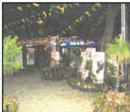
DENR's Indigenous & Endemic Trees Expo 2006. A partial view of the exhibit at the Garden Area G-02 at SM City North Edsa, Quezon City.

for Culture and Arts, the National Commission for Indigenous Peoples and the Commission on Higher Education.