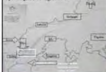
Map Showing the Zamboanga Peninsulas

The SPLC is applying for a 10,000 hectare IFMA area in Sibuco, Zamboanga del Norte, close to its existing IFMA area in Sirawai in the same province. The area is