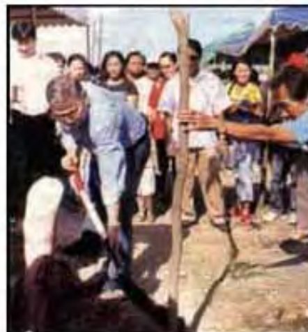
Greening at Smokey Mountain. DENR Secretary Angelo Reyes plants the first tree to start the urban greening at the Smokey Mountain, Tondo, Manila, a part of Program: Green Philippines