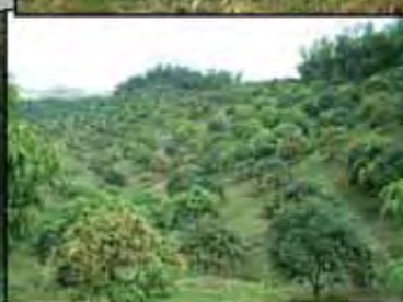
For replication. Clockwise: map showing the location of the proposed IFMA area SPLC will develop under the Program: Green Philippines; gmelina, mango and rubber plantations already developed in SPLC area.

proposed for the model it will be a replica of SPLC's large-scale industrial tree developed IFMA area in plantation. Once completed, Sirawai.