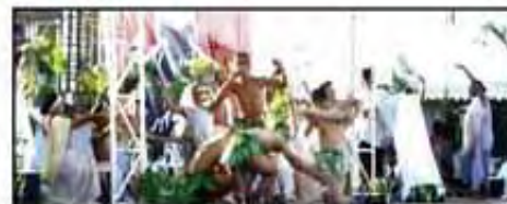
"A penitential rite with emphasis on asking forgiveness for the sins of omission and commission against God's wonderful creation"

The PWPA has committed to create a mini-forest surround the church to be erected in, and greenbelts around tenement houses and along the estero of, Smokey Mountain, Tondo, Manila as a part of the urban greening under the Program: Green Philippines.