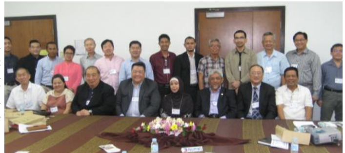
The delegates from the PWPA, PWWA, MTIB, DENR & DOST are all smiles after a fruitful round table discussion.

Philippine Wood Producers Association (PWPA) welcomed the Malaysian Timber Industry Board (MTIB) for a two-day meeting to check on the status of builders' joinery & carpentry (BJC) and moulding products in the Philippines as well as to promote and increase exports of Malaysian-made products in the local market last March 10 to 11, 2016.