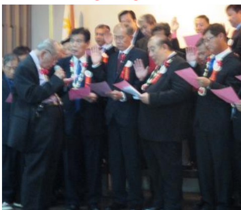
Photo Highlights of the PLMA's 71st Induction & Turn-over Ceremonies