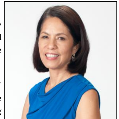
New DENR Secretary Regina Paz “Gina” Lopez

The Philippine Producers Wood Association of the Philippines (PWPA), in their letter dated June 24, 2016, congratulated and warmly welcomed the new Environment Secretary and pledged its support and cooperation to her future initiatives in the department, and hopes that together, they will be able to make a difference in preserving forests and the local wood industry.