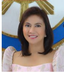
VP Leni Robredo

Instead of a ribbon cutting, a cake (molded as piles of lumber) cutting ceremony was done to open the event, followed by a festive dance of Ati-Atihan