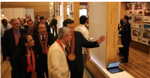
Guests looking around the exhibition area.