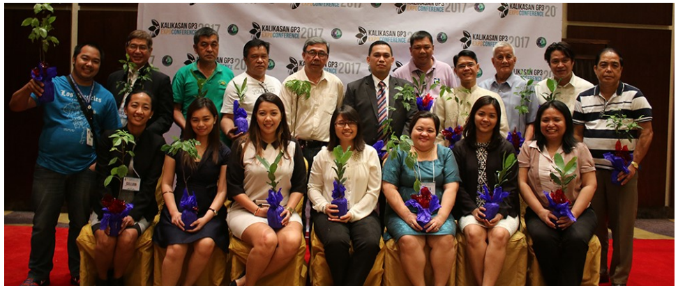
Members of the Technical Committee on Forest and Forest Products (TC 78) posed after its first meeting last March 24, 2017 at the New World Manila Bay Hotel, Manila.

Presentations on the status of the Philippine Forest Certification System, the BPS directives that mandates the BPS to be the standard governing body of the country and how standards are being developed to guide the TC members in their responsibilities in developing standards for the certification system of the country were made.