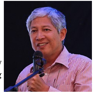
DENR Undersecretary for Policy and Planning, Forester Marlo Mendoza

Uy added that establishment of ITPs is very much needed by the industry considering that majority of the raw materials were imported already and the country and the community were not getting its benefits when raw materials are imported. When the country produces its own raw materials, there is inclusive growth.