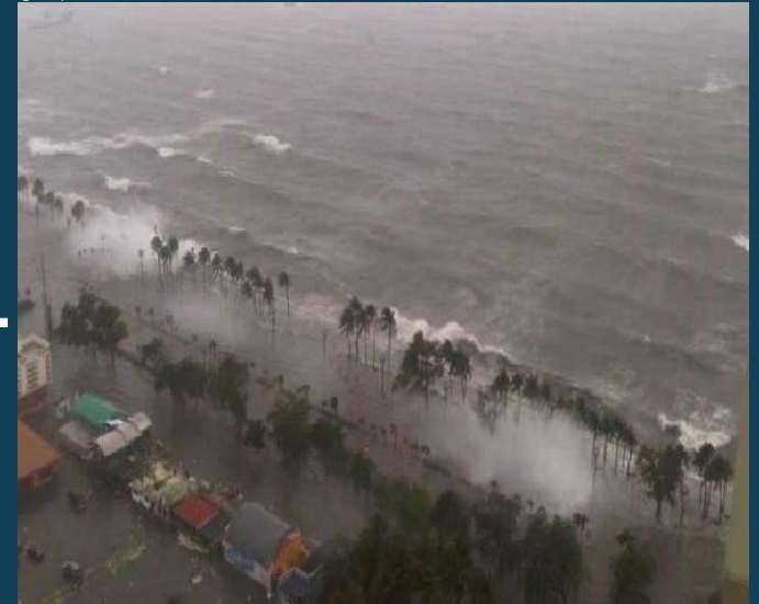
Manila Bay Sept 2011 Typhoon