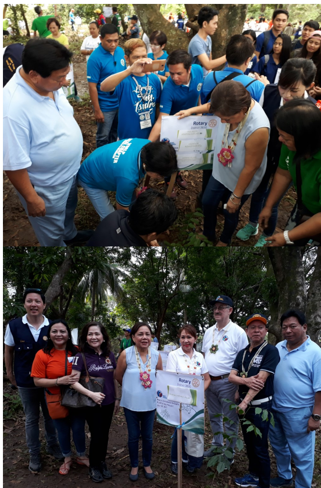
CFNR Germplasm Project representatives made the coordination with the Rotary District 3830 and the City Government of Antipolo.

Prior to the event, the PWPA with the UPLB