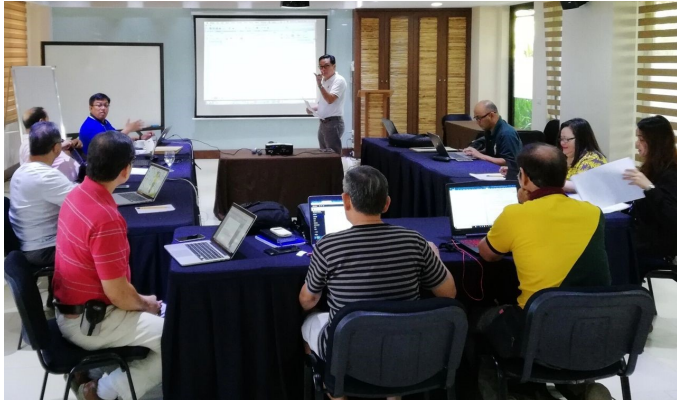
Sustainable management group writeshop for the consolidation of the SFM Bill.

The sustainable management group met again for a review and writeshop of the consolidated SFM bill last May 11-12, 2018 at the Abagatan Ti Manila, Alfonso, Cavite. The purpose of the activity is to consolidate the bills assigned to the group.