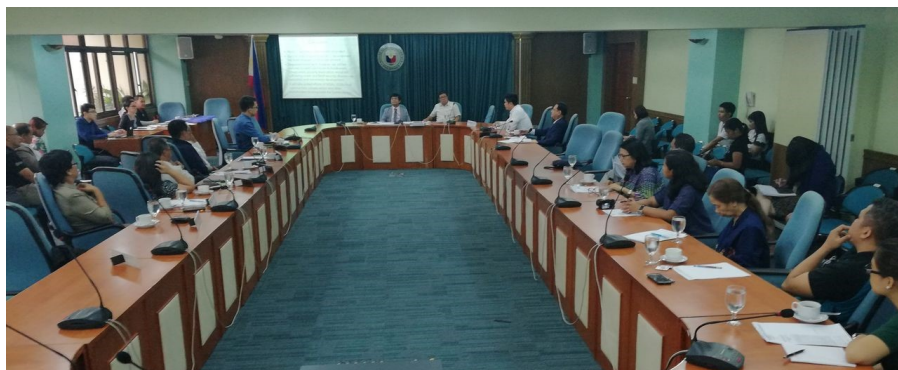
Substitute Bill Presented to the House Committee on Natural Resources

The House Committee on Natural Resources called for a meeting for the presentation of the substitute SFM Bill last August 8, 2018 at Mitra Bldg., Batasan Complex, Quezon City.