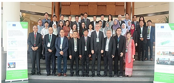
Participants from the ASEAN Working Group on Forest Products Development (AWG FPD), AFPIC members and private sector members of eight (8) ASEAN Member States (Cambodia, Indonesia, Laos, Malaysia, Myanmar, Philippines, Thailand and Vietnam) joined the ASEAN Secretariat (ASEC), the MTIB and the Facility in the public-private workshop.

A technical visit was made to Tanggam Design Center arranged by the Malaysian Timber Industry Board.